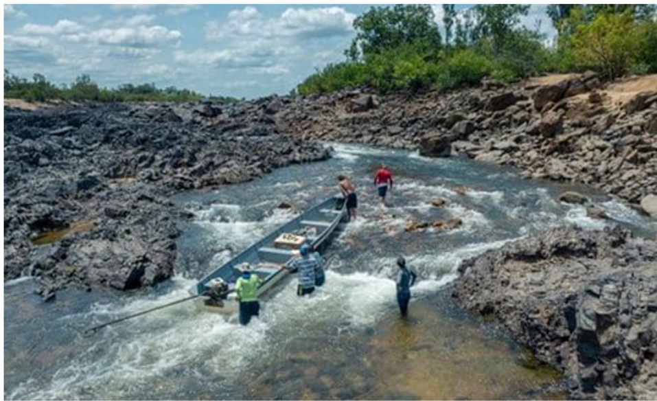
Fig. 2. Reduced water flow in the Volta Grande of the Xingu River, a 130-km stretch between the two dams that comprise the Belo Monte Hydropower Plant, decimates aquatic and seasonally flooded ecosystems, deprives traditional populations of fish and impedes transportation. (Watts, 2019).

In addition, protocols for impact assessment studies have not yet been developed for the severe changes to complex and interconnected Amazonian rivers and associated flooding cycles, which impact specific habitats and species and can affect extensive seasonally flooded areas downstream of dams (e.g., Gerlak et al., 2020; Latrubesse et al., 2017; RTAC/USAID, 2020; Schöngart et al., 2021). The protocols employed by staff hired by Norte Energia systematically fail to find any significant impacts, despite the disruption being obvious to local people and to independent researchers (Pezzuti et al., 2018; Zuanon et al., 2019). The environmental impact assessment for Belo Monte (Brazil, ELETROBRÁS, 2009) severely underestimated virtually all impacts of the project (Magalhães and Hernandez, 2009; Ritter et al., 2017). In addition to environmental impacts, multiple violations of human rights were committed in implementing the dam project (e.g., AIDA, 2018). Brazil's press coverage of Belo Monte and other dams has been found to downplay or ignore social and environmental impacts and to emphasize the narratives of the hydroelectric industry asserting that these dams are needed for economic progress (Mourão et al., 2022).