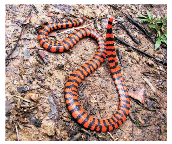
Figure 1. Dorsal view of A. scytale from Coari, state of Amazonas, Brazil, showing defense posture.

Anilius scytale (Linnaeus 1758), Aniliidae (Fig. 1) is commonly found in the Amazonian forest (DIXON & SOINI 1977, Duellmann 1978, Cunha & Nascimento 1981, 1993, Martins & OLIVEIRA 1998), although it has also been recorded in deforested areas, in areas of Cerrado (states of Goiás and Mato Grosso, Brazil), and in humid forest enclaves within the Caatinga region (state of Ceará, Brazil) (SILVA-JR 2001). The scarce information available indicates that A. scytale has fossorial habits and can occasionally be seen both on the ground and in aquatic environments, where it forages mainly at night. It can also be active during the day, but this habit has been observed less frequently (e.g. Beebe 1946, Cunha & Nascimento 1978, Duellman 1978, Dixon & SOINI 1986, VANZOLINI 1986, MARTINS & OLIVEIRA 1998). Recently, MASCHIO et al. (2007) observed that females of A. scytale in Eastern Amazonia have seasonal reproduction, with developed follicles recorded mainly from the end of the dry season (May to October) to the middle of the rainy season (November to April). Newborns were recorded mainly in the rainy season.